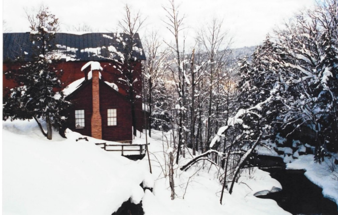
Grist Mill Snow—2011

Rensselaerville Historical Society owns a historic grist mill located on Main Street in the hamlet of Rensselaerville, where Ten Mile Creek crosses under the bridge.